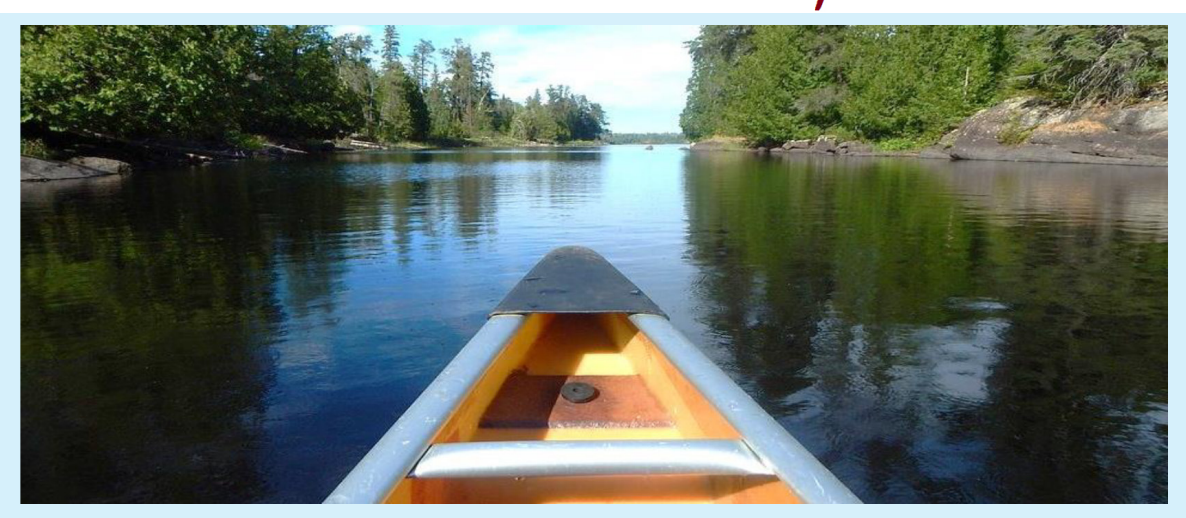
Staying Safe in the Summer Sun

ummer in Minnesota is a wonderful time of the year for outdoor fun and activities. It's important, however, that while we enjoy the summer fun, we also protect ourselves from potential sun damage/cancer and heat-related illnesses.